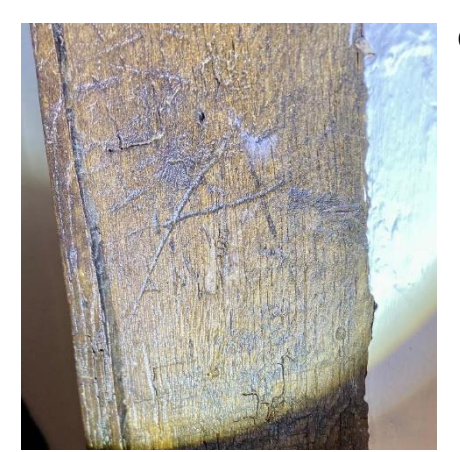
On the west frame of dearne door (blocked) crude A?